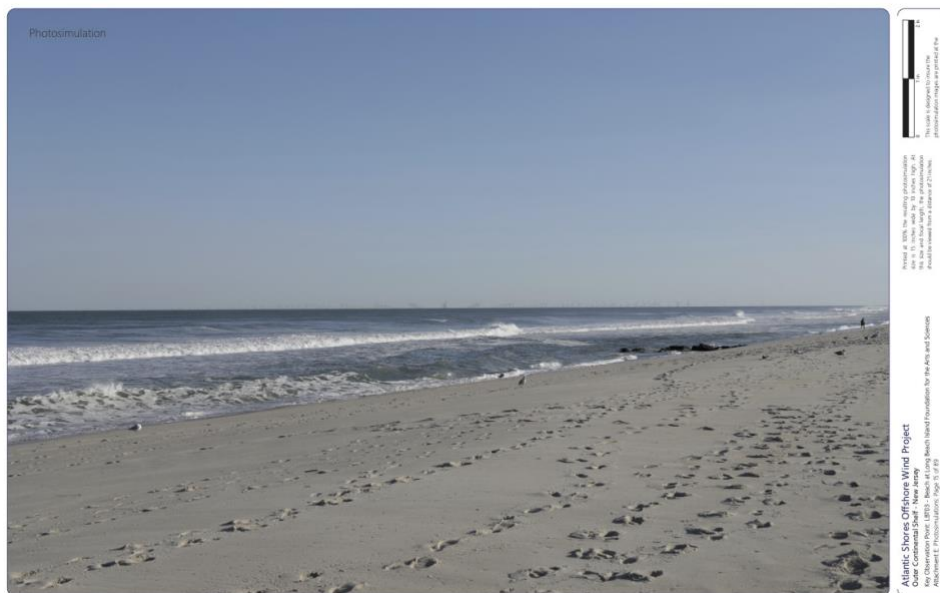
Photo simulation of the view of the turbines from the beach east of Beach Haven Historical area:

Photo simulation of the view of the turbines from the beach directly east of the LBI Foundation of the Arts & Sciences: